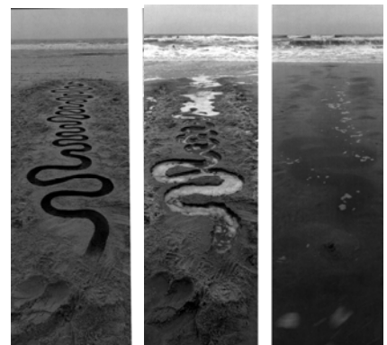
Goldsworthy, Schoorl, Provincie Noord-Holland, March 1999.

Movement, change, light, growth and decay are the lifeblood of nature, the energies that I try to tap through my work. I need the shock of touch, the resistance of place, materials and weather, the earth as my source. Nature is in a state of change and that change is the key to understanding. I want my art to be sensitive and alert to changes in material, season and weather. Each work grows, stays, decays. Process and decay are implicit. Transience in my work reflects what I find in nature. - Andy Goldsworthy